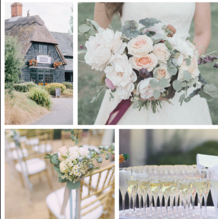
The Woodman Inn Nuthampstead SG8 8NB